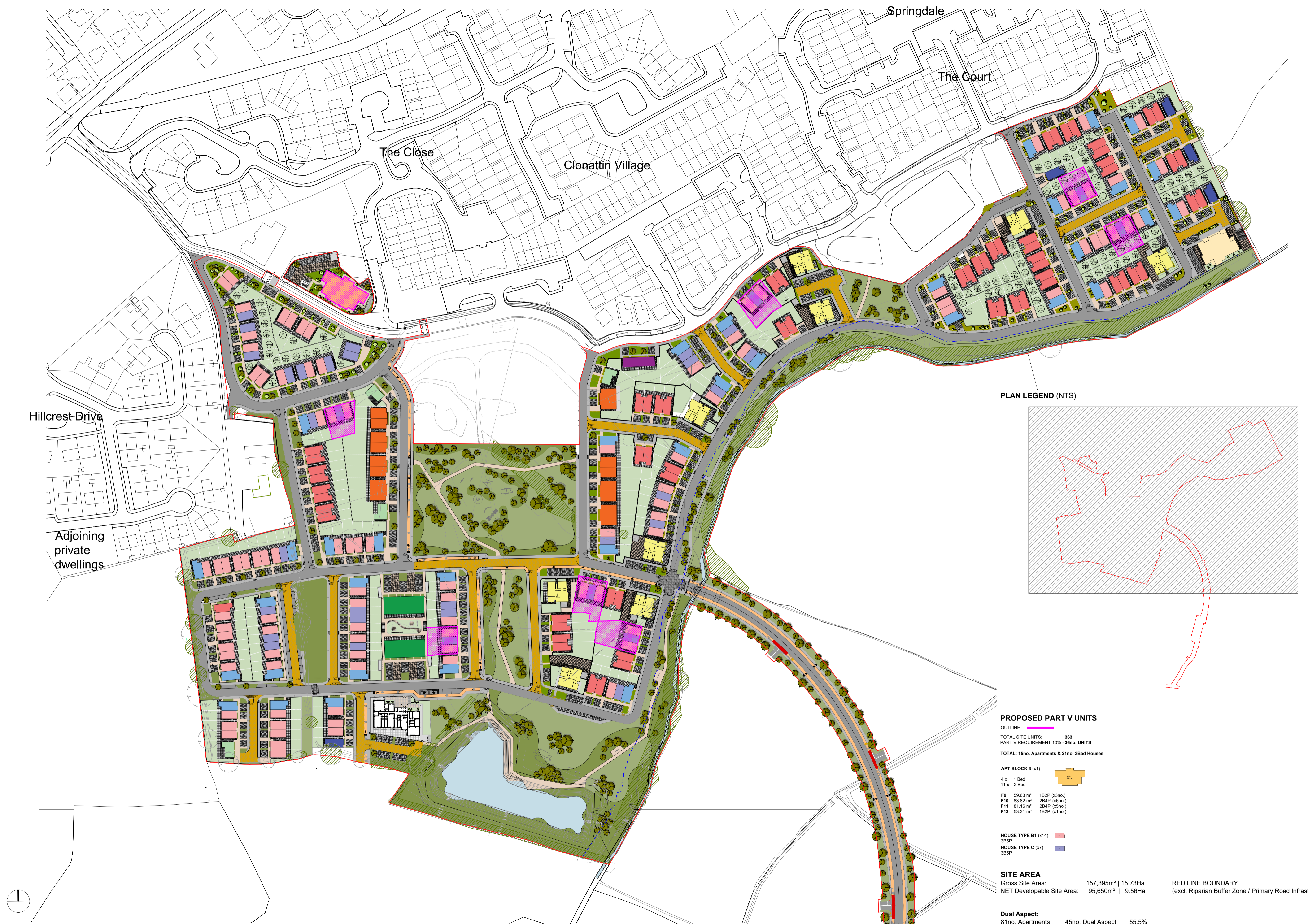
Site Layout_Proposed Part V Allocation

RED LINE BOUNDARY (excl. Riparian Buffer Zone / Primary Road Infrastructure)